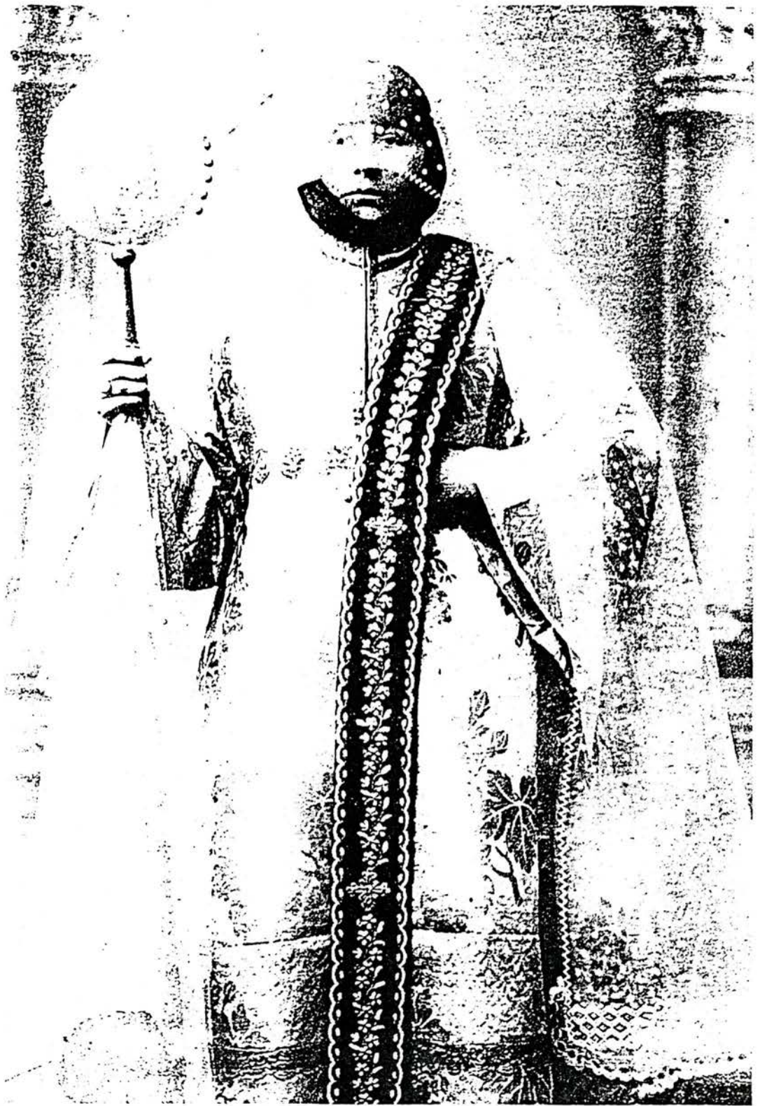
Photograph, circa 1890, Jerusalem, on the occasion of her promotion to Proto-Deacon