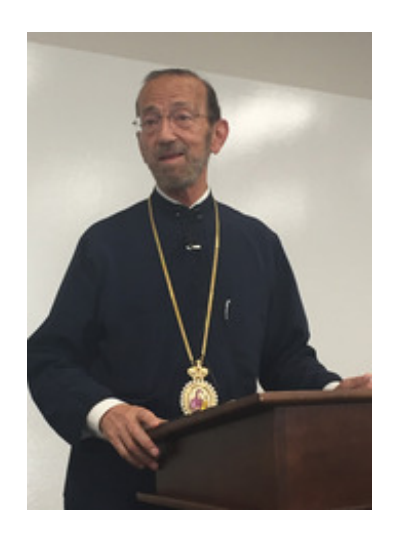
Address by Metropolitan Gerasimos