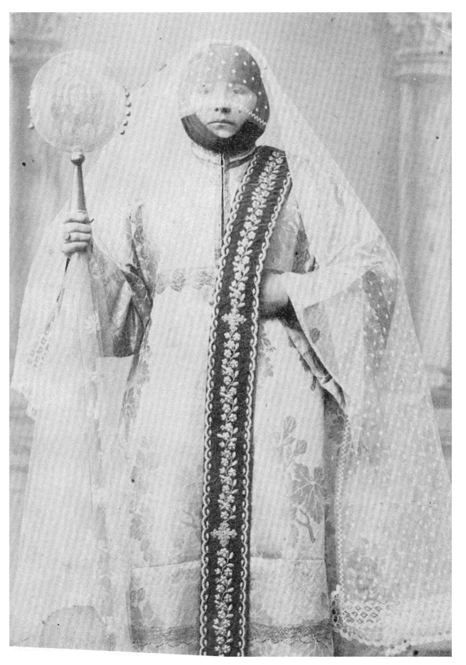
Vested Armenian deaconess of the late 19<sup>th</sup> century